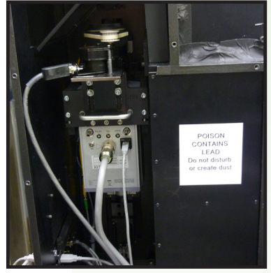
Detector housing for the CCD camera lens, mirror, and scintillator.