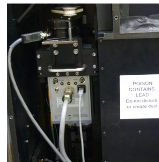
Detector housing for the CCD camera lens, mirror, and scintillator.