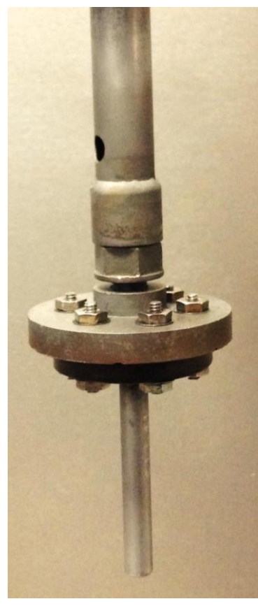
Figure 4. Sample can on stick.