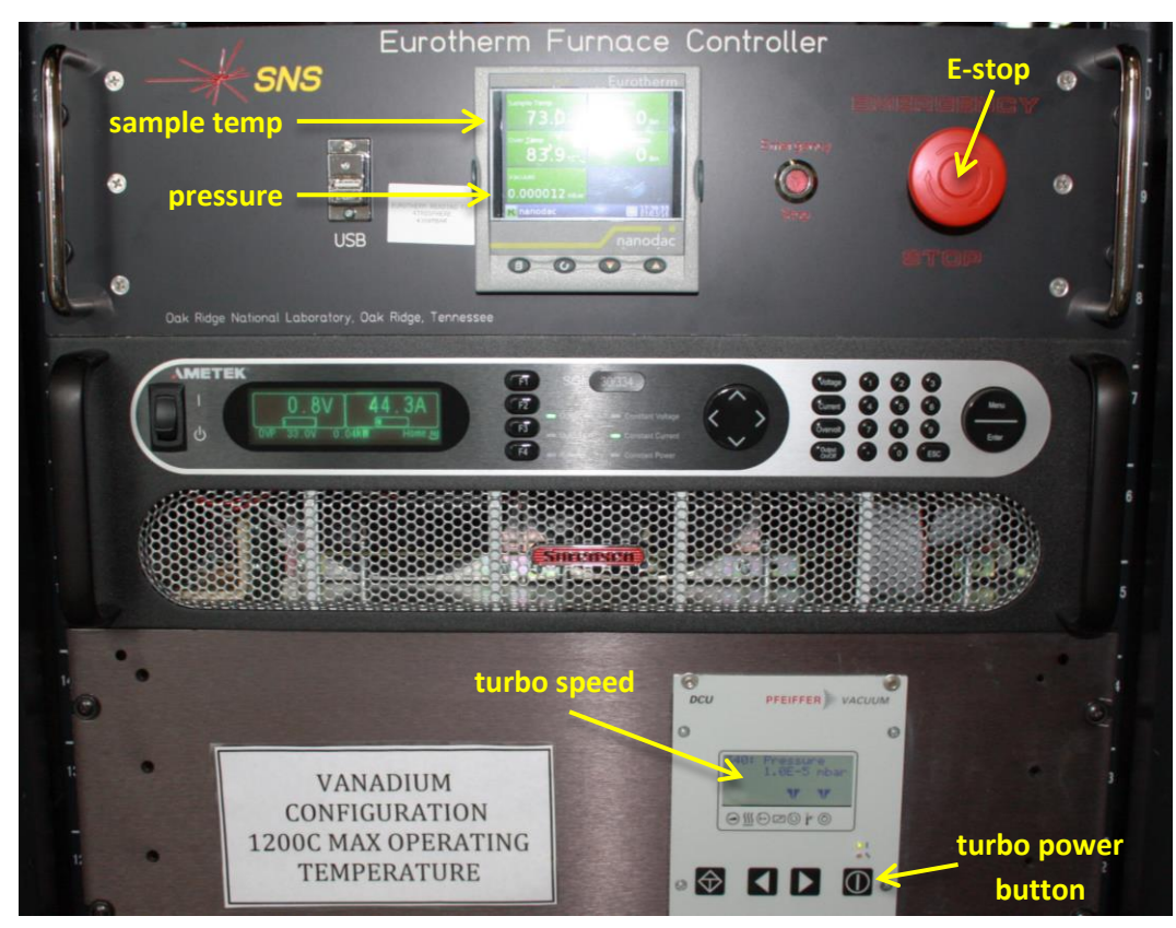
Figure 2. MICAS furnace controller.