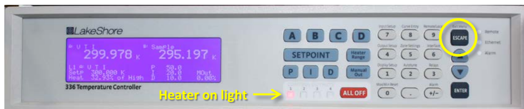
Figure 3. Lakeshore 336 temperature controller, showing the Escape button.